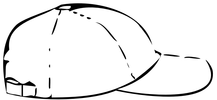
Right Side of Hat