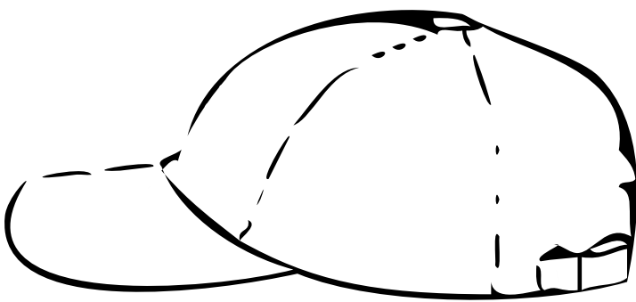
Left Side of Hat